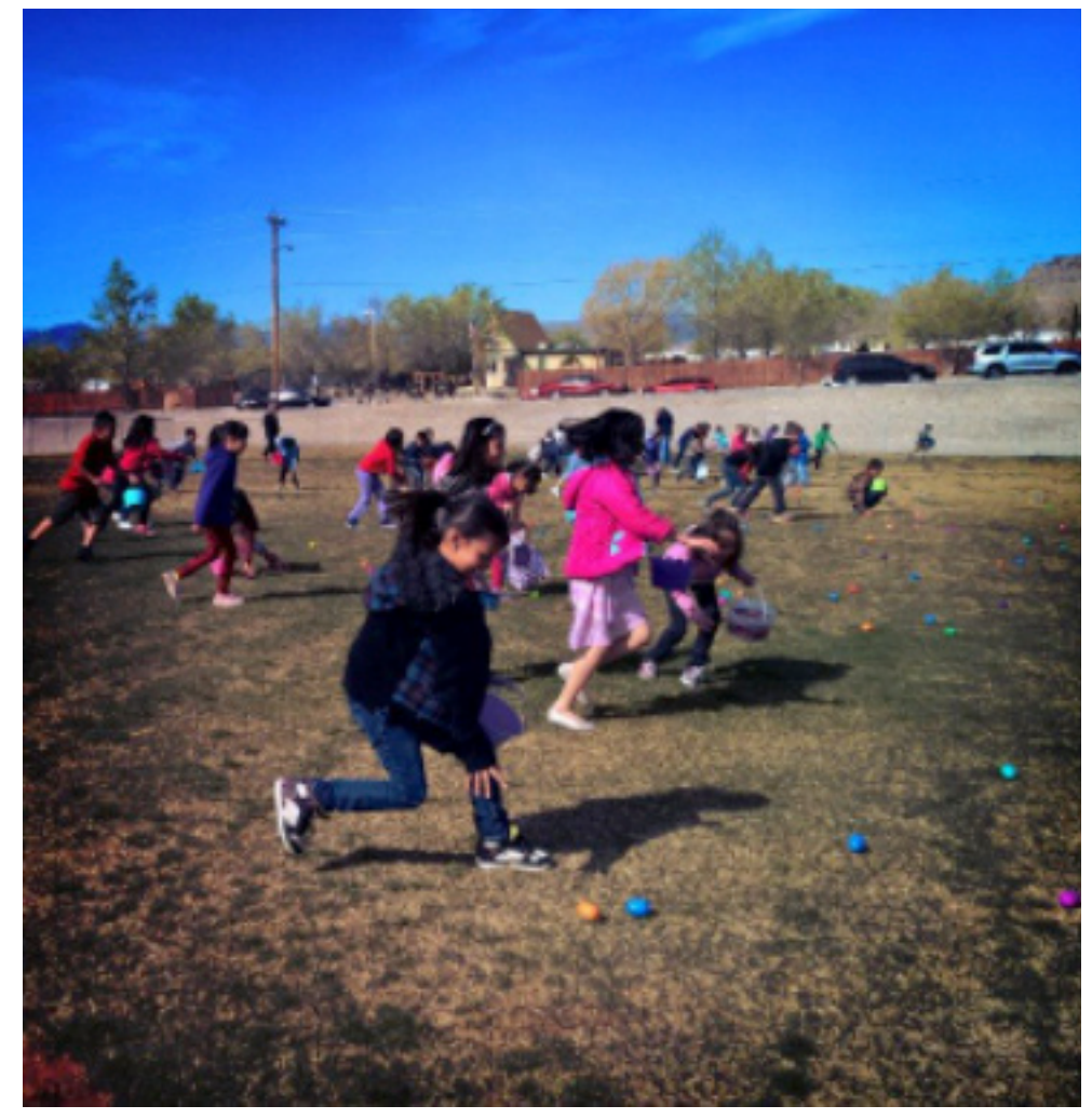
Children from West Wendover scramble to fill their baskets with Easter eggs.

On April 4th, hundreds of children from West Wendover participated in the Annual Easter Egg Hunt. Newmont a once again donated to the fun event!