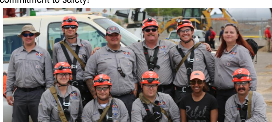
Newmont's Phoenix operations mine rescue team

At the 29th annual Safety Olympiad held in early July in Elko, Nevada, teams from twelve mines in the states of Nevada, Wyoming and Utah were tested on their confined-space rescue, firefighting, high-angle rope rescue, first aid, triage and hazardous material handling skills. A simulated accident on the mine site involving multiple vehicles, patients and explosives in a mining blast pattern were prominent features of this year's event. Newmont's Phoenix team won the Fire Scenario category and Newmont's Carlin Team placed 3<sup>rd</sup> in the Triage Scenario, and was also named third overall best performer among their competing group of 6 mines. Congratulations to these teams for their hard work and commitment to safety!